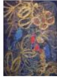
Monsoon #9 2001