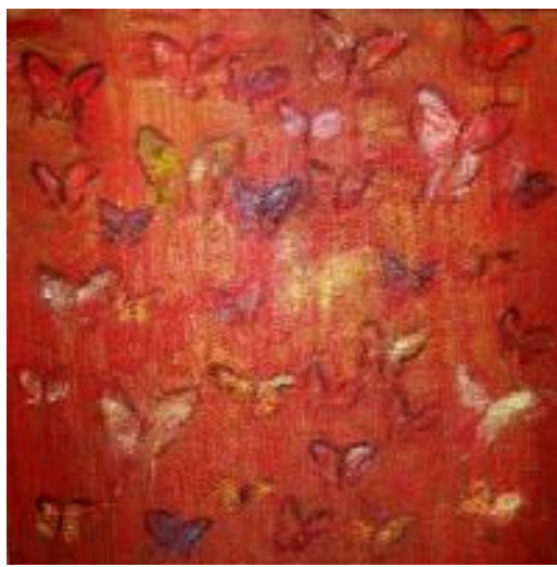
Red Butterflies Hunt Slonem oil on canvas 48 x 48 inc