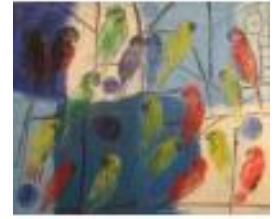
Blue Picul, 2006