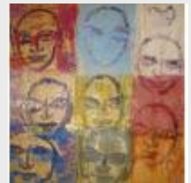
8 Saints 2005