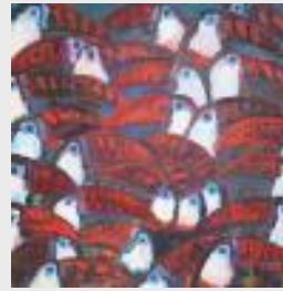
Channel Bill (Toucans)

Artadoo © Mediadata srl - designed by Leftloft