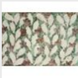
"Monarchs, Doves, Guardians"