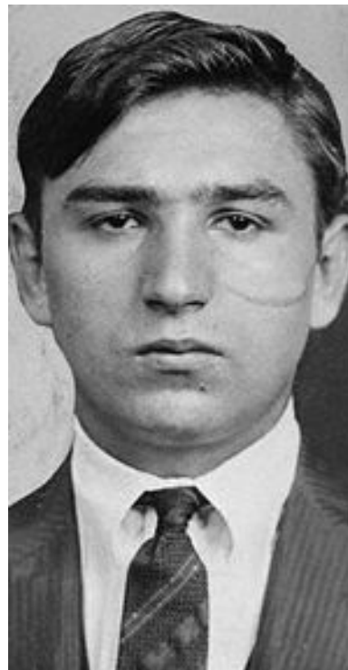
NYPD mug shot of Jacob Orgen

Orgen was released and on the streets again in 1923. Quickly becoming a formidable rival again to Kaplan, Orgen gradually built up a powerful organization which included members such as gunmen Louis "Lepke" Buchalter , Jacob "Gurrah" Shapiro , and Jack "Legs" Diamond . Orgen, allied with Solomon Schapiro , challenged Kaplan over labor slugging activities, particularly in the garment district . In 1923, a gang war broke out after a