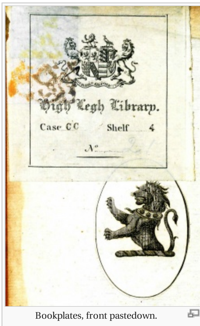
Bookplates, front pastedown.